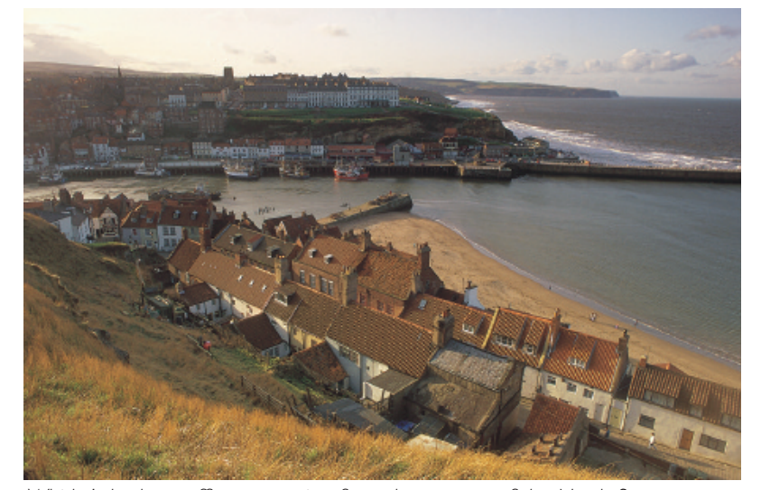
Whitby's harbour offers protection from the ravages of the North Sea.

A shroud of mist envelops a farm in Birkdale.