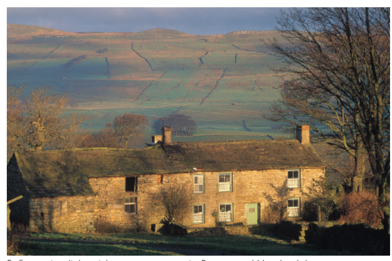
Soft evening light picks out a cottage in Burtersett, Wensleydale.